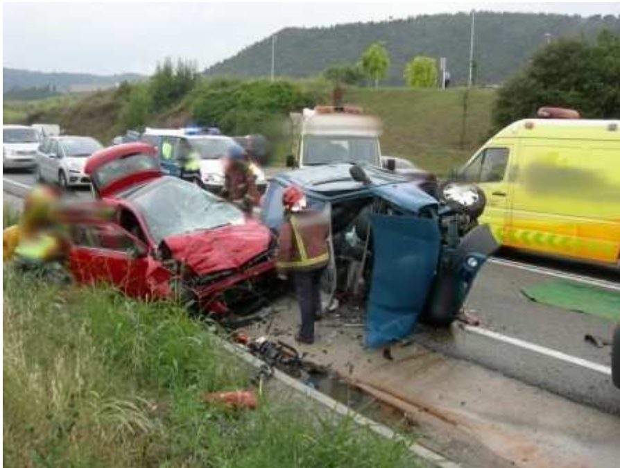
Figure 1: Vehicles on the accident scene of an accepted CASPER case from Spain

The accident data collected in CASPER expanded the existing database with cases from previous European projects. As a result, the available database had information from 806 cases (1300 restrained children). It is also important to highlight that the Database is not representative of the overall European child car passenger population as a selection bias was used to collect the data (a bias for severe injuries was introduced). But it contains enough data to allow an indication of the body regions being injured in different CRS types or for different ages of children along with insights into how restraint conditions and the quality of use lead to injury (Kirk et al. 2012). On Figure 1 is shown the accident scene of an accepted CASPER case from Spain.