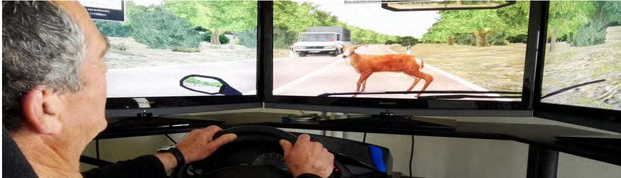
Figure 1. Unexpected incident in rural road

During each trial, 2 unexpected incidents were scheduled to occur during the drive (Figure 1). More specifically, incidents in rural area concerned the sudden appearance of an animal (deer or donkey) on the roadway, and incidents in urban areas concerned the sudden appearance of an adult pedestrian or of a child chasing a ball on the roadway or of a car suddenly getting out of a parking position and getting in the road. The hazard did appear at the same location for the same trial (i.e. rural area, high traffic) but not at the same location between the trials, in order not to have learning effects. Regarding the time that the hazard appeared, it depended on the speed and the time to collision, in order to have identical conditions for all the participants to react, either they drove fast or slowly. The accident risk was calculated as the proportion of the total incident crashes to the total incidents happened.